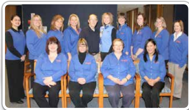
(Left to Right as shown in the picture)

Catholic Federal Credit Union would like to recognize the following staff members who are celebrating a milestone anniversary in 2013 with the credit union.